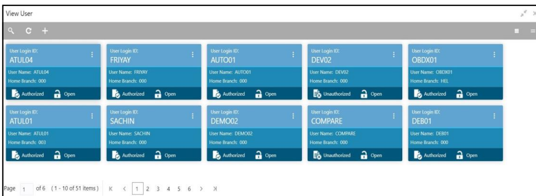
Figure 1.3: View User

For more information on menus, refer to Table 1.3: View User - Field Description .